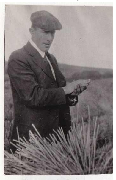
Dad removing husk from grain to examine kernels