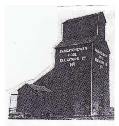
Lindquist Wheat Pool elevator